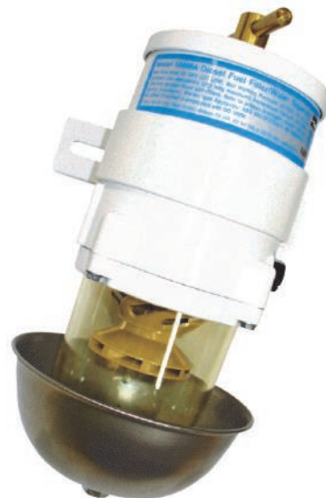
Parker Racor Fuel Filter

Together, we can protect your investment in engines and fuel, maximize fuel economy, performance and maintain a clean environment.