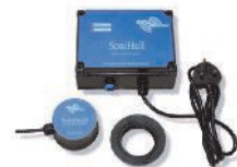
Very easy to install Kits available for cats and monohulls