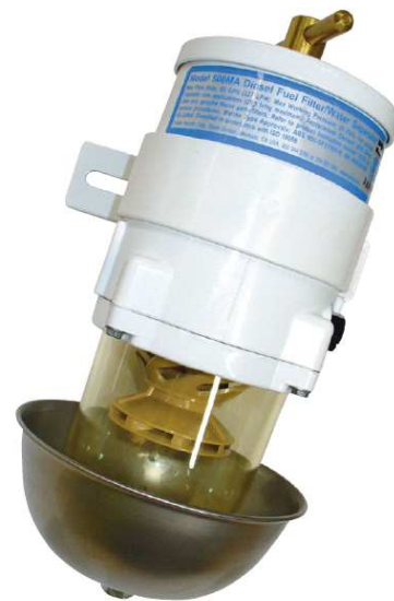
Parker Racor Fuel Filter

Together, we can protect your investment in engines and fuel, maximize fuel economy, performance and maintain a clean environment.