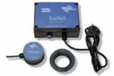
Very easy to install Kits available for cats and monohulls

Tests demonstrate that electronic antifouling products have no adverse effect to fish. The 'SONIHULL' Ultrasonic signal stays very close to the hull structure and does not stray into open water.