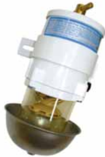
Parker Racor Fuel Filter

Together, we can protect your investment in engines and fuel, maximize fuel economy, performance and maintain a clean environment.